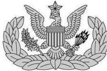
Figure 2 – Senior MEMS Badge